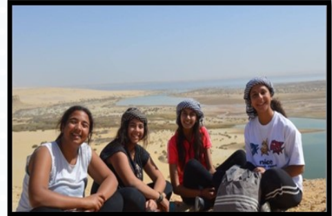
Our atypical nomads stealing the light off EL FAYOUM's incredible views.

visits to MAYDOUM pyramid, whale valley, EL RAYAN waterfalls and TOUNIS village, two overnight stays in a hotel, horse rides, a whole journey of sand boarding and bonfire with nomads. All in all, it is a great trip worth every penny paid and is totally recommended if you're down for fun.