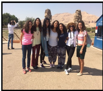
Getting to know our great ancestors

living there are so welcoming. We'd like to share a junior's testimony with our readers: "We stayed in a man's house and his wife was serving us tea while other women were drawing for some girls on their hands or necks using the black henna. Other girls went shopping in EL Nubba stores "el Sok"; everything was hand-made and simple which was even more fascinating. It was one of the best trips, we learnt new things about the pharaohs, our ancestors, architecture and their lifestyle and we also had so much fun dancing, shopping and discovering new places as well as a whole new culture.