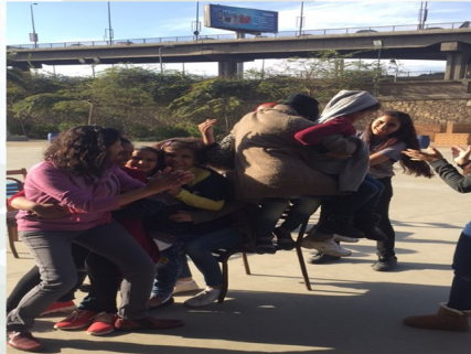
Students playing with the children at school